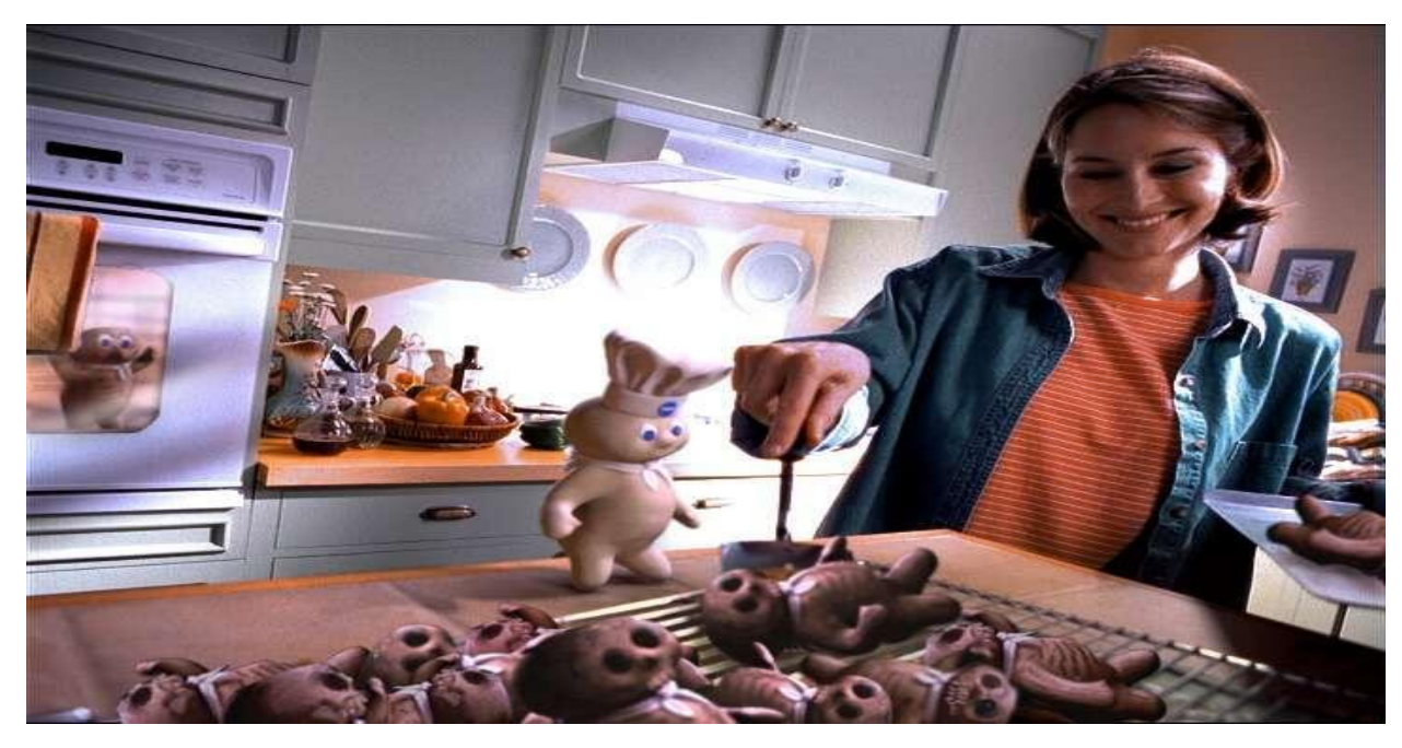
The HASH's New MUNCH MIESTER makes up some treats!